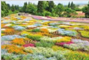
Field of Spring Colors / late April to late May