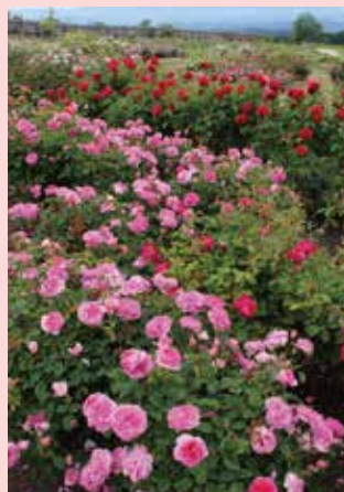
Rose Garden / late May to mid October

The Kuju Garden is colored by a variety of flowers, trees and perennial plants. The Rose Garden has 3,500 roses of 350 varieties. The Clematis Garden features not only clematis but also Fujibakama bonese, for which chestnut tiger butterflies come flying.