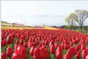
Tulip / mid April to early May

From spring through autumn seasonal flowers bloom in the field divided into 6 areas.