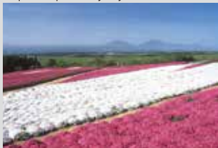
Moss Pink / late April to early May