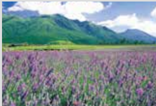
Lavender / late June to mid July

Fully enjoy Mother Nature. Visitors can feel refreshed 24 hours a day, surrounded by flowers.