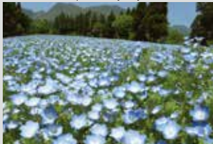
Nemophila / late April to early June