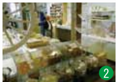
Perfume and gift shop Kazekobo

All varieties of begonias and tropical flowering trees bloom in abundance, including begonia bulbs arranged in a large ring.