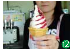
Fast food Basil

A buffet that mostly offers wild grasses and fresh vegetables grown in Kuju Kogen. They have prepared a menu with 40 varieties on any given day. Also recommended is toriten (deep fried chicken), a popular local dish of Kuju.