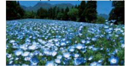
▲ Nemophila (late April – early June)