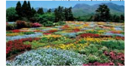
▲ Spring-colored field (mid April – early June)