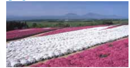
▲ Moss pink (mid April – early May)

The best time to see the flowers from spring to autumn