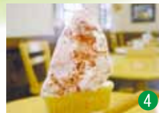
Gelato shop Charlotte

Includes a photo exhibit of magnificent Kuju Flower Park throughout the seasons. You can also enjoy coffee and light snacks, and participate in a craft workshop on the premises.