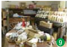
Wild grass tea Chamu

Lavender, amao strawberries, peaches and other seasonal soft ice creams are bestsellers! Nothing beats eating soft ice cream while viewing the Kuju mountain range.