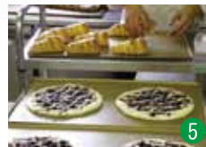
Handmade bread workshop Pascolo

A shop that offers gelato made with 100% Kuju Kogen milk, the choicest coffee, and cakes which use eggs produced right in Kuju.