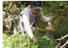
Buffet restaurant No no Yasai

A general purpose souvenir shop. Offers special products from Kuju, goods from the Flower Park and much more.