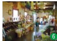
Dried flowers and gift shop Rose de Mai

The flower village bakery. Take home freshly baked bread or eat your lunch surrounded by flowers.