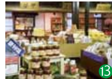
Local specialty goods shop Hana no Eki

The bestseller here is the blueberry soft ice cream! The mildly tart taste of the blueberries is a big hit.