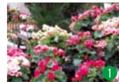
Green House Antilles

Blueberry field (Early July – Late August) 10 varieties of blueberries are cultivated here. You can pick blueberries during harvest season.