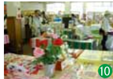
Souvenir shop Gin no Mori

Try samples of health drinks mixed with wild grasses, grains and fruits. The experiences of this area's pioneers have lessons of wisdom for living.