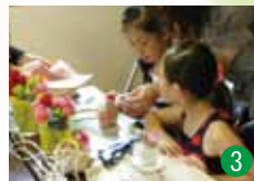
Tea shop gallery and hands-on experience workshop Moegi Yakata

Offers an assortment of aromatic products and therapeutic goods. Promotes a lifestyle surrounded by fragrances.