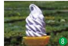
Fast food Camomile

A shop offering specialty products from nature's blessings, such as fresh vegetables and delicious pickled foods, as well as other miscellaneous Japanese items.