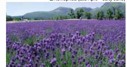
▲ Lavender (early June – mid-July)