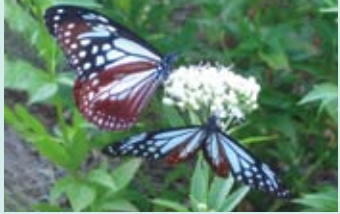
Parantica sita will be around in Spring and Autumn.

Warm all year around where you can enjoy plants and flowers such as Begonia and Fuchsia.