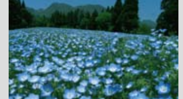
Nemophila (late April till early June)