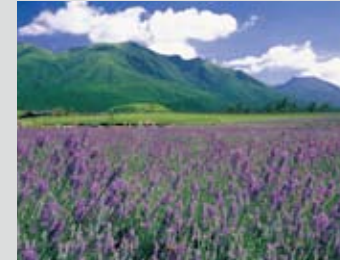
Lavender (late June till mid July)