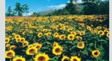
Sunflowers (late July till early August)