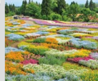
Assorted spring flowers (late April till late May)