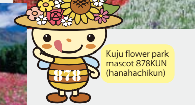
Kuju flower park mascot 878KUN (hanahachikun)