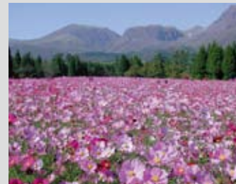
Cosmos (late September till mid October)