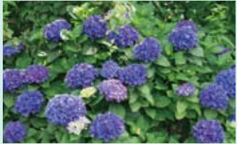
Between mid July and August, the forest will be filled with deep colours of Hydrangea.