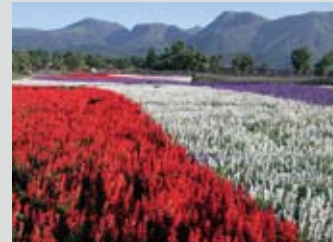
Salvia (early September till mid October)