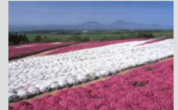
Phlox subulata (late April till early May)

Flower seasons may change slightly due to weather and.