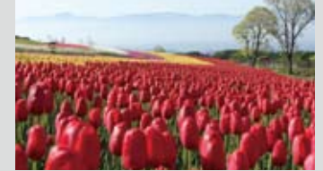
Tulips (mid April till early May)