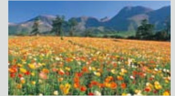
Poppy (late April till late May)