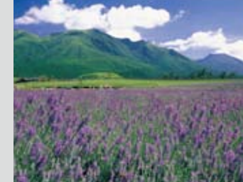
Lavender (late June till mid July)