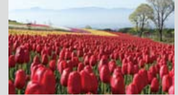
Tulips (mid April till early May)